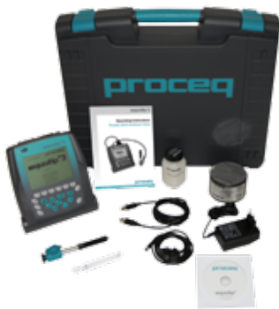
353 10 100 unit D

Equotip3 indicating device, AC adapter, carrying case, USB-cable, Equotip CD, operating instructions and quick reference guide. The customer needs to buy the appropriate impact device and test block in addition to the Equotip 3 basic unit