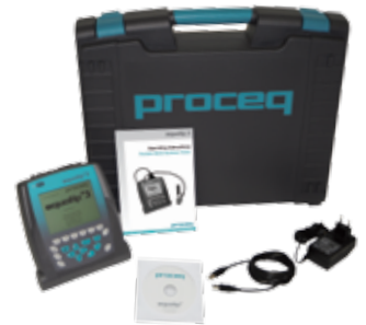
353 10 050 basic unit