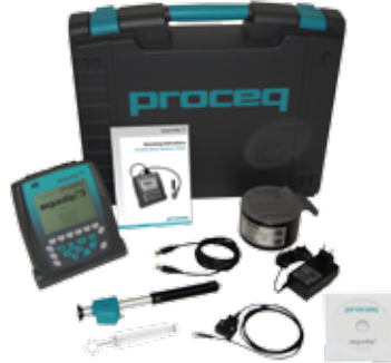
353 10 300 unit G